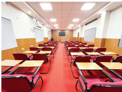
Smart Class Room